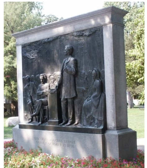
Laredo Taft's Lincoln-Douglas Debate Memorial in Quincy featured in exhibit.